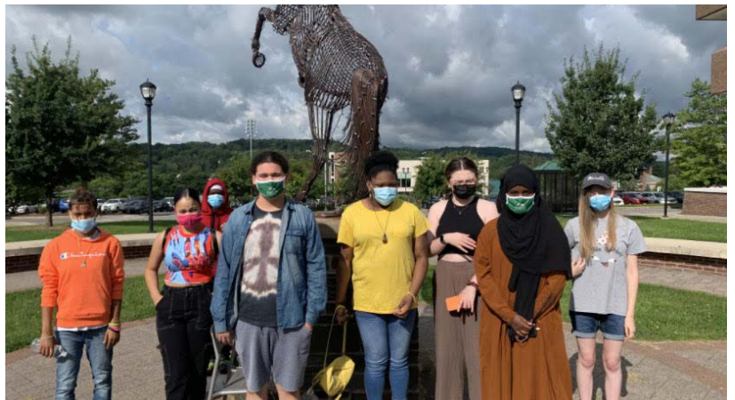
Lock 2 students visit SUNY Morrisville