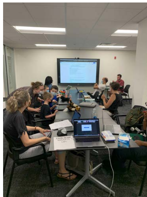
Careers in Code Cohort 2 in action

You can view , a flashback of their journey here , and photos from the graduation ceremony here .